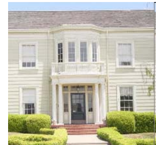
Martinelle District Colonial Brewington Avenue