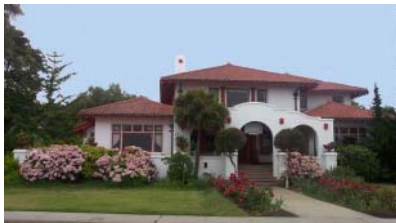
Spanish Revival Style House Darling House on West Cliff Drive

This year marks the 25th anniversary of the Symphony League's Holiday Home Tour, and to celebrate that event, we're giving the Home Tour a brand new look.