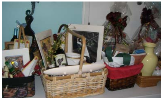
Gift baskets lined up and ready for the Basket Boutique

We are lucky to have such a well-rounded artist performing for us!