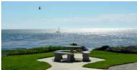
Beachfront Contemporary Condo East Cliff Drive