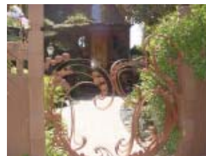
Oceanview Contemporary Seacliff Drive

Trinity Presbyterian Church is located at 620 Melrose Avenue in Santa Cruz.